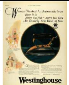
1925 Magazine Advertisement

George Westinghouse invented the air-brake for railroad use in 1869 when he was a 22 year-old engineer. He founded the Westinghouse Electric Company in Pittsburgh in 1886. He was a proponent for Alternating Current, fighting against the Direct Current electrical system pushed by Edison at the time. A major win in this fight was when Westinghouse Electric won a contract to provide generators for the new hydroelectric power station at Niagara Falls in 1893. George Westinghouse died in 1914 at the age of 67. In 1920 the company set up the first commercial radio station which broadcast in East Pittsburgh. The first electrical appliances for consumers were also introduced in the 1920s. The company offered a variety of products, from electric ranges to smaller household appliances. It introduced a line of electric refrigerators in 1930 and washing machines soon followed. In 1941, Westinghouse entered the military electronics business, with radar as its main product. . As it grew, the company was a leading inventor and manufacturer for radar, nuclear power, submarines, and jet engines. In later years, its divisions diversified widely, including electronics, household appliances, radios and broadcasting, TV parts, and Seven-Up soda. This diversification was not widely successful, and by the 90's the company streamlined into a handful of core divisions.