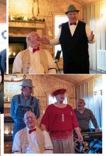
A Roast of our outgoing president was received in good humor!