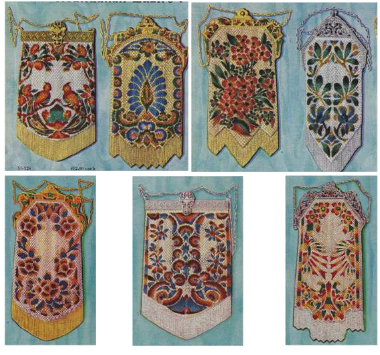
S.G. Clausin & Co 1931 Wholesale Jewelry Catalog

Mandalian patented their "Luster pearl Finish" in 1927. This pearlized enamel coating was guaranteed to be chip resistant, and has stood the test of time quite well. Mandalian also had frames that were often more complex than the competition's. Here are some examples from a few era catalogs I have.