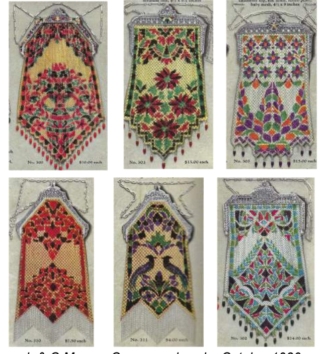
L & C Mayers Company Jewelry Catalog 1930

mayonnaise, and fold into Jell-O. Turn into mold. Chill until firm. Unmold on platter on crisp chicory. Garnish with radish roses and gherkins. Serves 10.