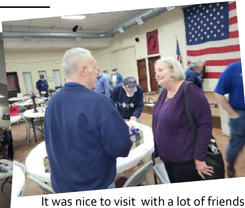
It was nice to visit with a lot of friends we hadn't seen for a while!