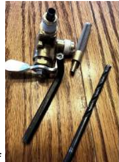
Gas valve retrofit components