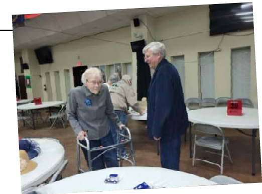
More bidding and a whole lot of visiting!