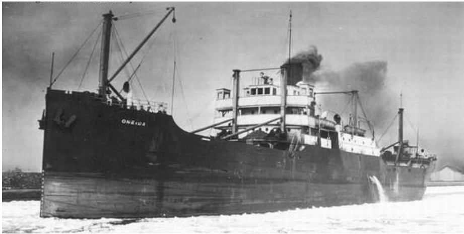
The "Oneida", date unknown