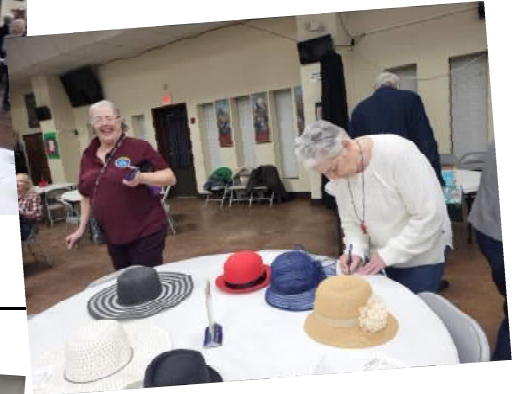
The hats were a favorite with the ladies!