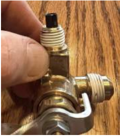
Gas valve with sleeve

With that in mind, here is a fix that I came up with to resolve the issue, and get the newly designed gas shut off valve to work with your existing tank screen. This fix is only applicable if you are replacing your gas tank shut off valve with this new design. If you have an old valve that accepts a screen you can still replace the screen with that gas tank shut off valve with no modifications. Basically, this fix is creating your own sleeve to work with your newly purchased gas shut off valve and gas screen.