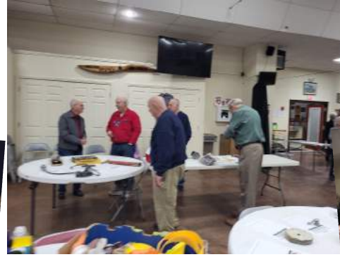
Lots of checking out the merchandise!