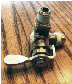
Gas valve with sleeve installed

Use a 1/4 Allen wrench (one that you will use as a donor part.) This will fit the opening of the gas shut-off valve that is hex shaped