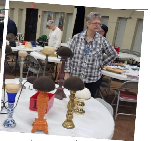
Hat stands were a popular item too!