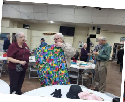
Not sure who ended up with it, but there was quite a bit of interest in this little quilt!