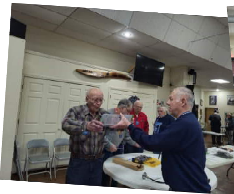
A little inspection before bidding!