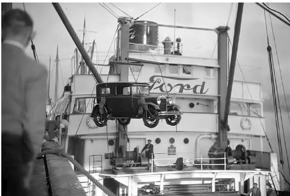
Model A being loaded onto what appears to be the Oneida, date unknown.