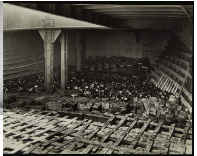
Hull of Freighter "Onondaga" Loaded with Automobile Parts, circa 1929