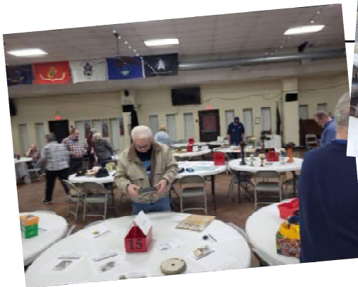
A long shot view of the many filled tables