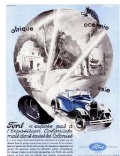
1931 French Ad