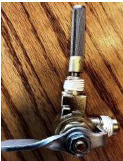
Valve with sleeve & screen installed

Taking the drilled out piece of the 1/4" stock, I cut the piece at approximately 3/8" - this will be your sleeve that will go into the gas shut-off valve. I used a file to smooth out any burrs or rough edges to ensure that the sleeve fit into the shut-off valve with slight pressure. I used a small amount of Permatex Permashield around the sleeve (that we just made) and the gas shut-off valve to ensure that I don't have any leaks around this area. It fits pretty snug, but it's always good to be sure.