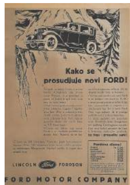
1930 Yugoslavian Ad