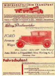
1931 German Ad