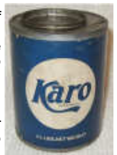
A 1929 Karo Syrup Tin

Interesting Note: Corn syrup is distinct from high-fructose corn syrup (HFCS), which is manufactured from corn syrup by converting a large proportion of its glucose into fructose using the enzyme D-xylose isomerase, thus producing a sweeter compound due to higher levels of fructose