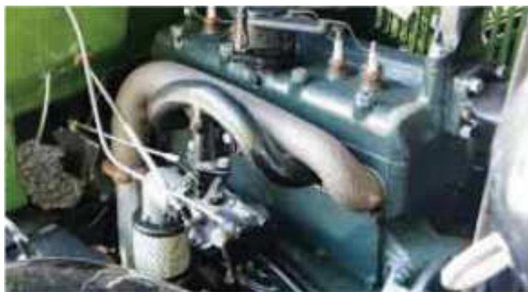
The most common type of exhaust systems are the single exit type which you'll typically find on cars and trucks you buy from a dealer. As the name implies, there's just one exhaust pipe running to the rear of the vehicle.

Last month's newsletter had Part 1 which explained how the manifolds connect to the port holes on the engine block. To use or not use the glands has opinions on both sides of the issue.